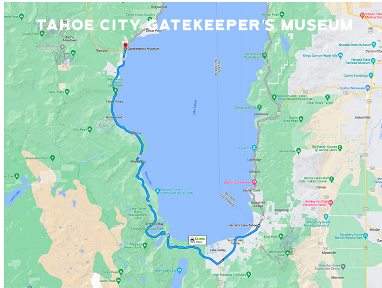
Tahoe City Gatekeeper's Museum 130 W Lake Blvd, Tahoe City, CA 96145 https://www.norhtahoemuseums.org/ 32.2 miles, 54 minutes (by car) map

This museum has a ton of Washoe history and information on the Lake! A nice walking path and dam over the Truckee River leading into Lake Tahoe.